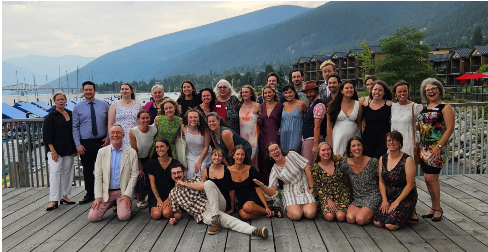
WKTEP class of 2024